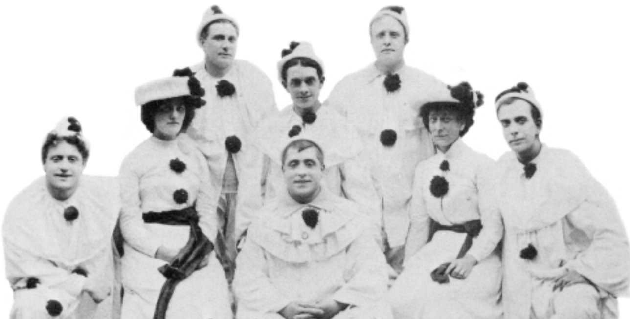
Gold's Margate Pierrots, circa 1912