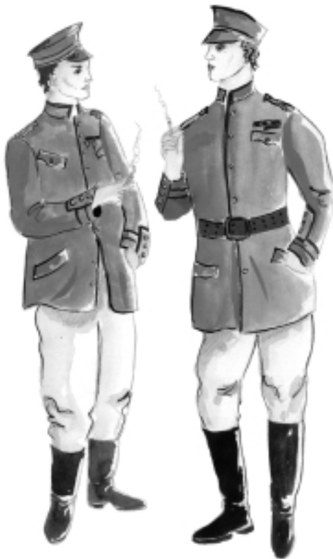
A German Sergeant