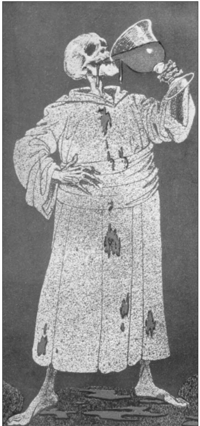
Cover of the Toppling of Civilization by Louis Raemaekers, 1917

regiments were raised in India and across the British Empire. For countries like Canada, Australia and New Zealand, the tragedies of Vimy Ridge and Gallipoli came to be remembered as battles that forged new nations. When the war ended the world mourned a “lost generation”. In every combatant country in Europe, agriculture and industry suffered extensive setbacks. Russia had been entirely transformed by revolution. The German Kaiser had been deposed, and the Austro-Hungarian Empire had collapsed. The United States was emerging as a new world power, and European dominance in international affairs was significantly undermined. And the Great War — far from being the war to end all wars — ushered in one of the most violent centuries on record.